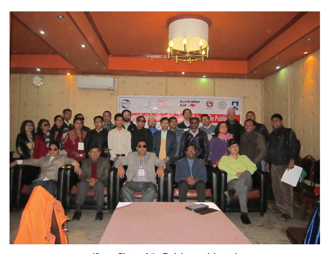
(Group Photo of the Training participants)