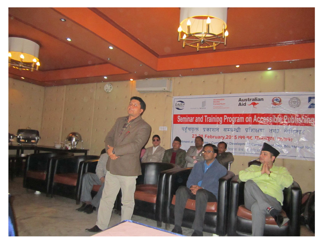
(The Honorable Rabindra Adhikary expressing commitments of supporting the ratification of Marrakesh Treaty)