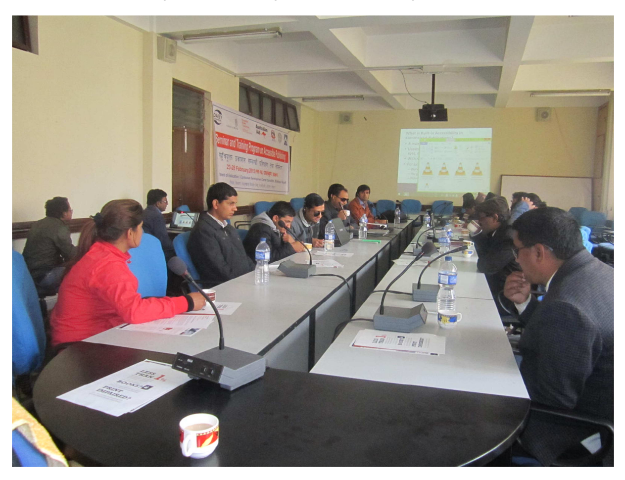
(Training about accessible publishing in Department of Education)

He finally called upon all disability community to join hands for drafting the rights based constitution and work together for ensuring accessible publishing.